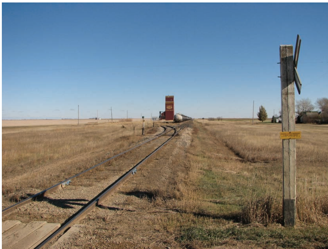
Stoney Beach grain elevator, 2006