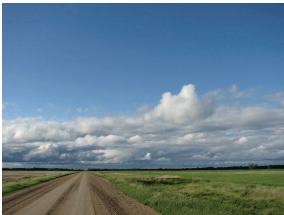
Father's Day at Truax - 17 June 2012 - 018