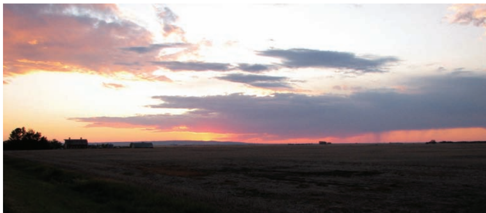
Aug 20 2006, Clouds over Dirt Hills, near Truax