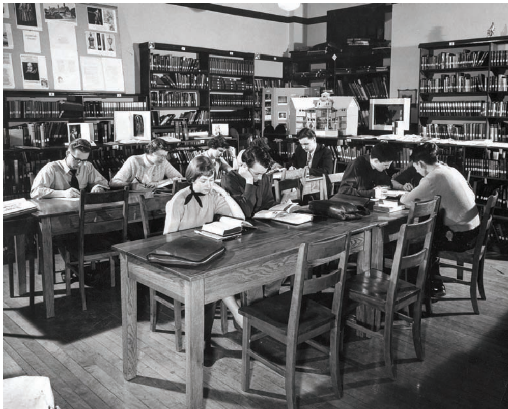
Library, January 16 1952

The U of T Student Chapter had a successful year and is already excited for next year!