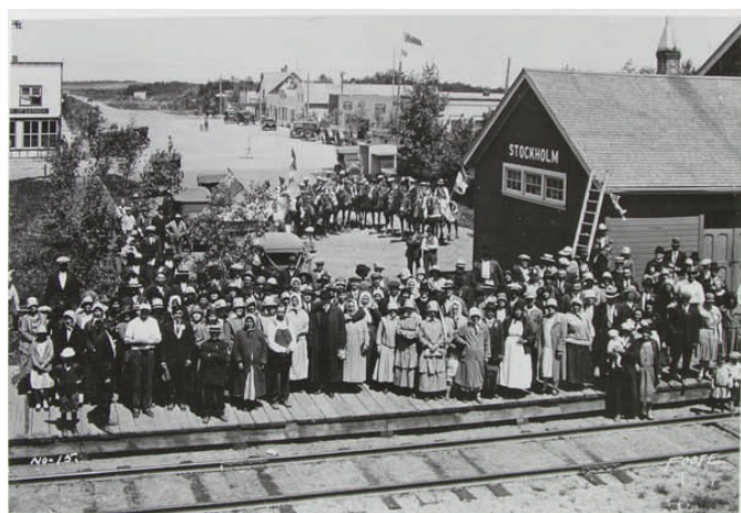
Stockholm 1928