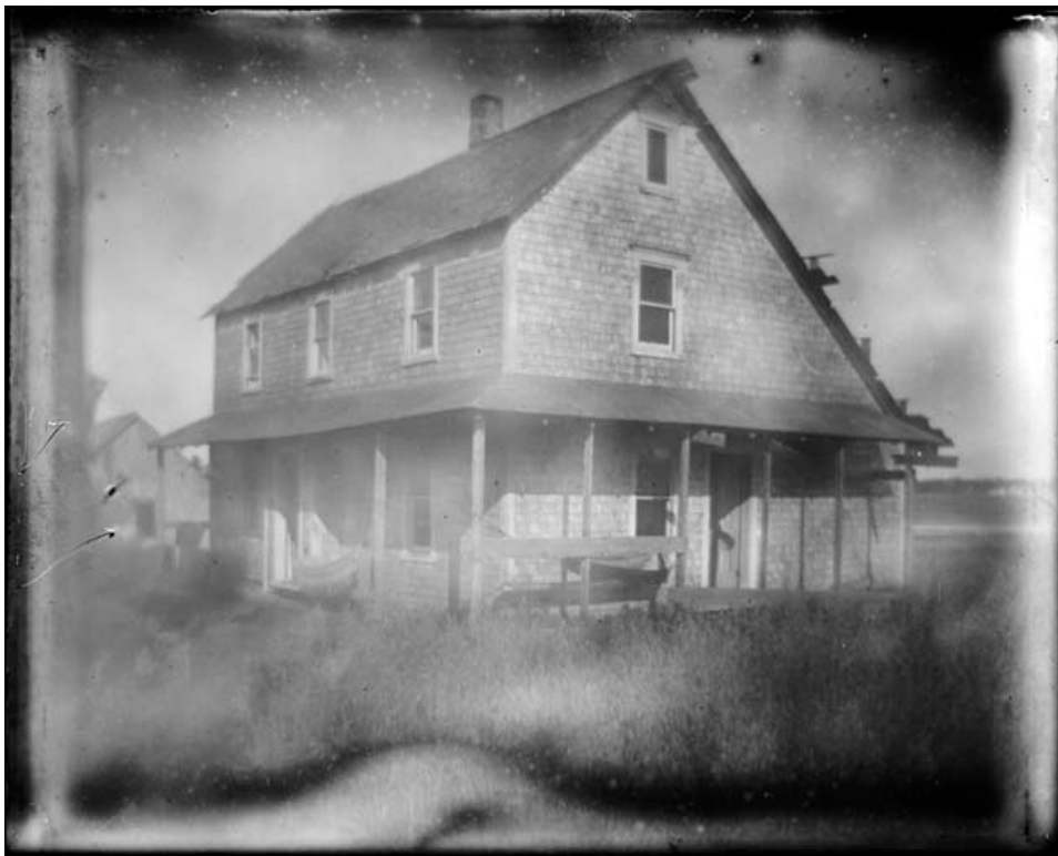
House under construction or repair, rural Prince Edward Island, ca. 1905-1920.