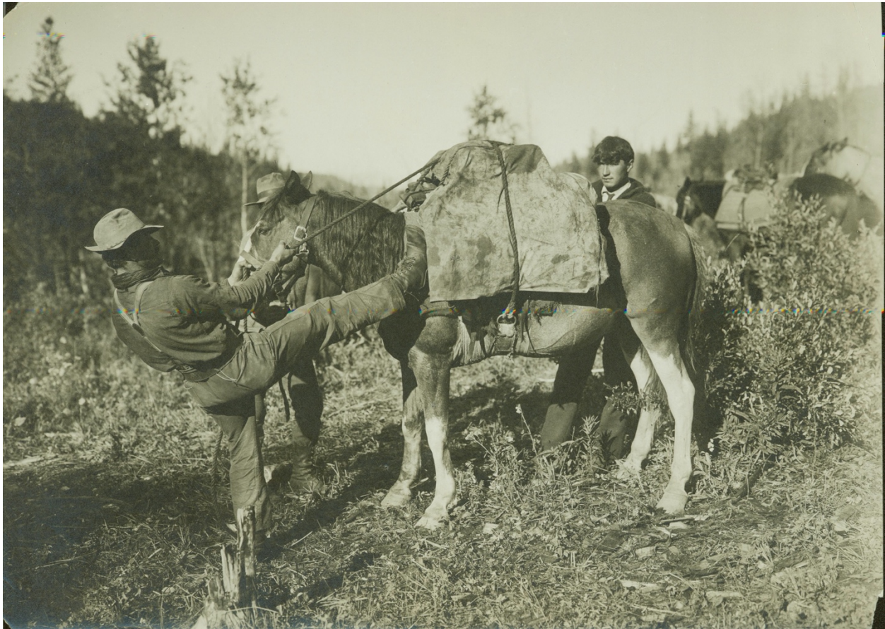
“unidentified men loading a pack horse: “throwing the diamond hitch.”

[3] NDRIO “About Us” webpage, accessed May 30, 2021 and available at https://engagedri.ca/about/what-we-do