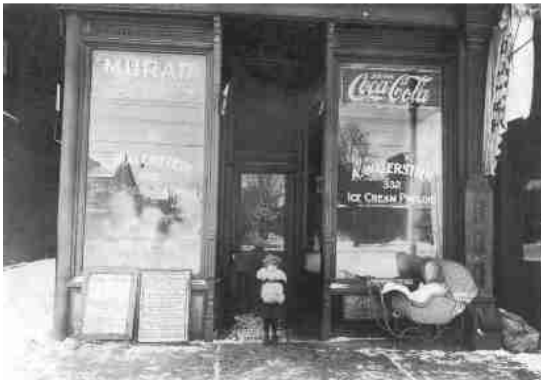
Walerstein's Ice Cream Parlour, ca. 1922, Ontario Jewish Archives, (photo #2533) Credit: ONTARIO JEWISH ARCHIVES