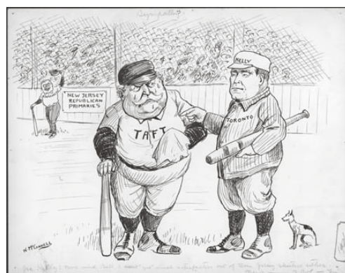
Creator: Newton McConnell, Digital Image Number: 10005988.jpg, Reference Code: C 301, Item Reference Code: C 301, 1996, Archives of Ontario

The East-West softball game will again be an ACA conference highlight. Who will earn bragging rights for 2011? Who will hoist the Doughty cup? Plan to participate, and cheer for your team. Remember, baseball is a simple game: you throw the ball; you hit the ball; you catch the ball. So get out there. This game's fun! Trinity Bellwoods Park, Diamond #2 (the middle diamond at the park.)