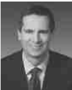
Dalton McGuinty Premier of Ontario - Premier ministre de l'Ontario

Je vous souhaite un congrès agréable et instructif.