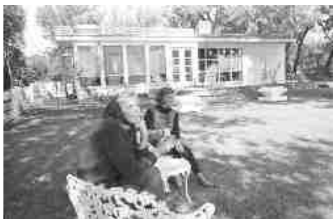
Two women outside a home on Toronto Island scheduled for demolition, 22 September 1964

Generously sponsored by Digital Curation Institute (DCI) and Faculty of Information, University of Toronto