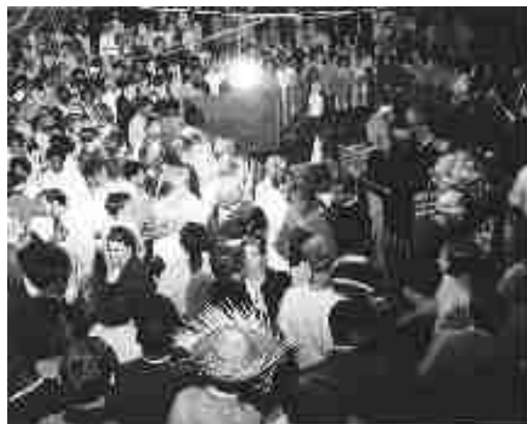
Crowd at night-time Caribana event on Centre Island, Toronto, August 1967

Please gather in the Delta hotel lobby at 5:30 for an enjoyable walk to the UofT campus.