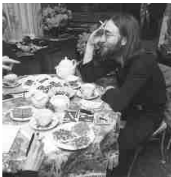
John Lennon at the kitchen table in Ronnie Hawkins' house, 18 December 1969.

Generously sponsored by the Stephen Bulger Gallery