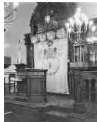
Kiever Synagogue (Toronto) interior, 1974