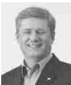
The Rt. Hon. Stephen Harper, P.C., M.P. Le très honorable Stephen Harper, c.p., député OTTAWA 2011

Je vous souhaite un congrès des plus agréables et fructueux.