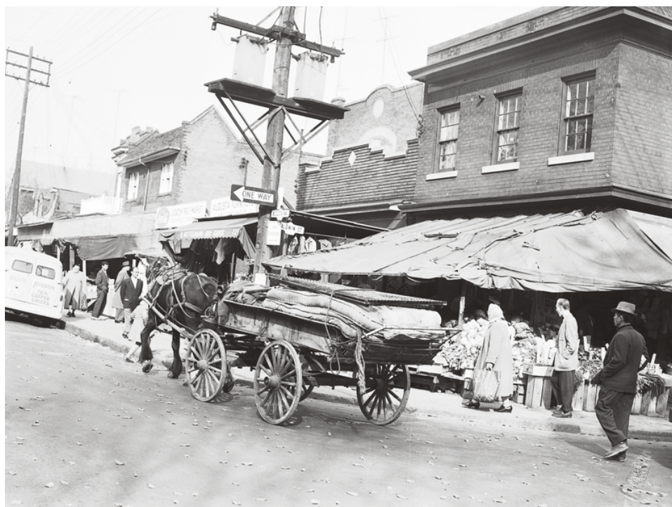
Image of corner of Augusta Ave. & Baldwin St. in Kensington Market, with horse-drawn cart in foreground., 4 November 1958 York University Libraries, Clara Thomas Archives & Special Collections, Toronto Telegram fonds, image ASC04676.