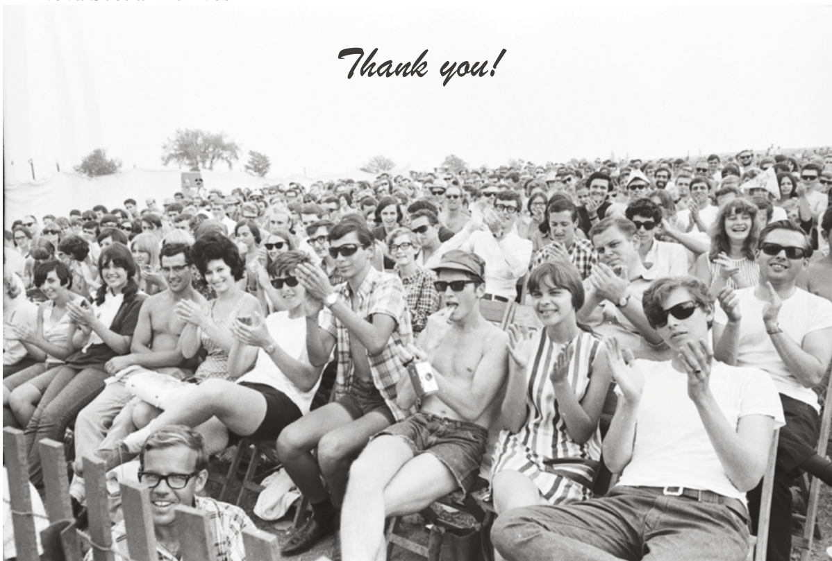
Image of audience applauding a performance, Mariposa Folk Festival at Innis Lake, 08 August 1966