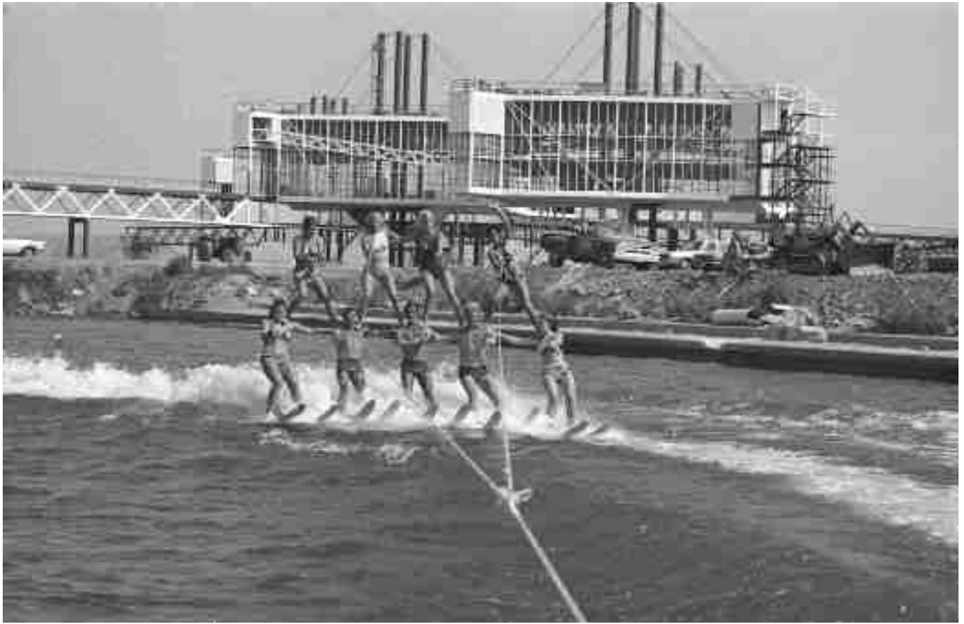
Image of three men and six women waterskiing in a pyramid formation as part of the CNE Aquarama show (Ontario Place under construction in background), August 1970