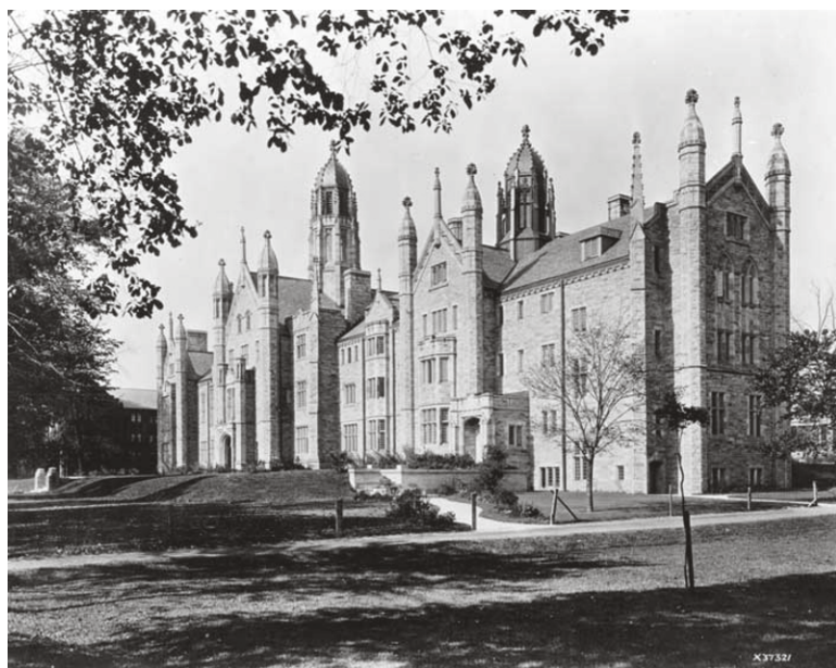
Trinity (Anglican) College [ca. 1925]