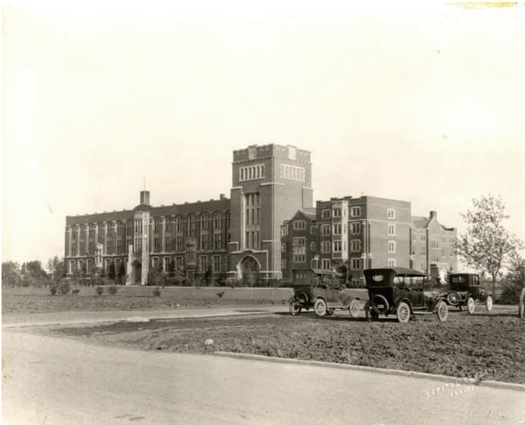
80-2_PhotoGraph 4_College Avenue Campus_1915