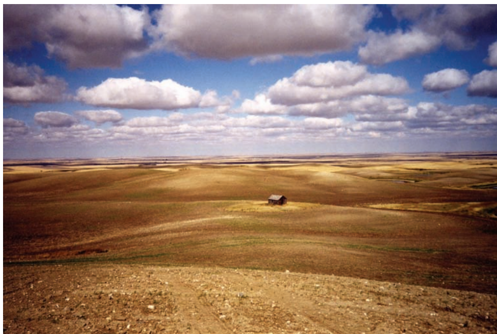
Truax area from Dirt Hills - 1998