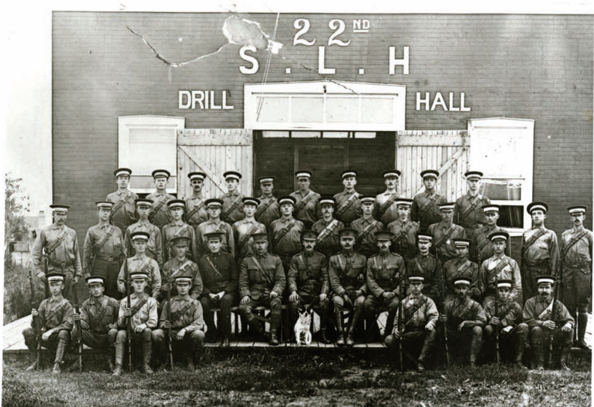
SAB_GM_R-A19019 22nd Saskatchewan Light Horse Company in a group photo in front of the drill hall ca. 1914

Just 2 blocks North of the conference hotel , come enjoy one of the largest beer menus in the city! Not sure what to order? Try a beer flight sampling of any three on tap beers to contrast and compare. The menu features numerous great dishes with beer pairings. The host team recommends the beerogies (which change daily), and the ale cheddar soup which is always a favourite!