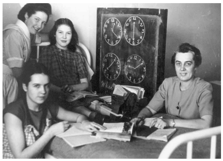
Children being instructed in school work at Polio Clinic, ca. 1943.