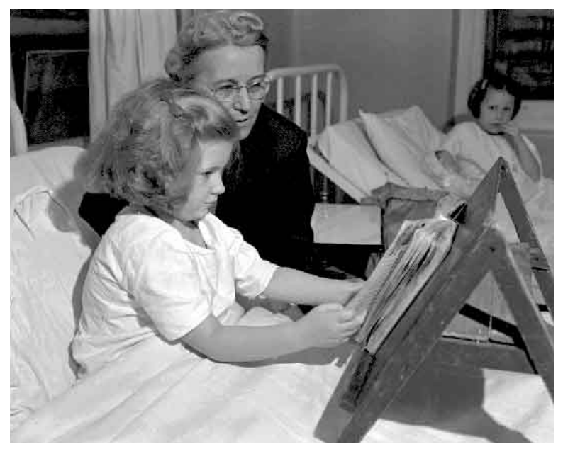
Spastic Child Reading, Children's Hospital, Vancouver, 1949.

All health-related organizations are a vital part of the community in which they exist. People often develop a strong attachment to the building in which they or their children were born; where they were ill and recovered; and where friends or family have died. The interaction between the hospital/clinic and the community is documented in records relating to fund-raising drives; volunteer activities; and the provision of secondary services such as grief counseling.