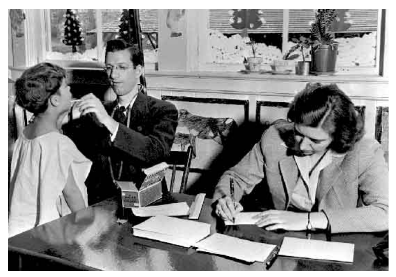
Medical checkup, Lumby School, North Okanagan, 1945.