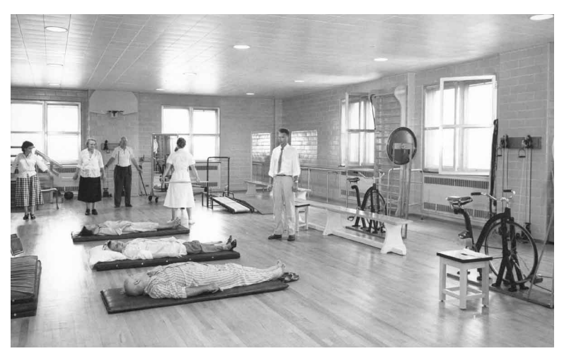
Gym - Rehab & Physical Medicine, Toronto General Hospital, Gerard Wing., ca. 1958.

treatment of the patient, but they may also be used in: the continuing care of the patient: