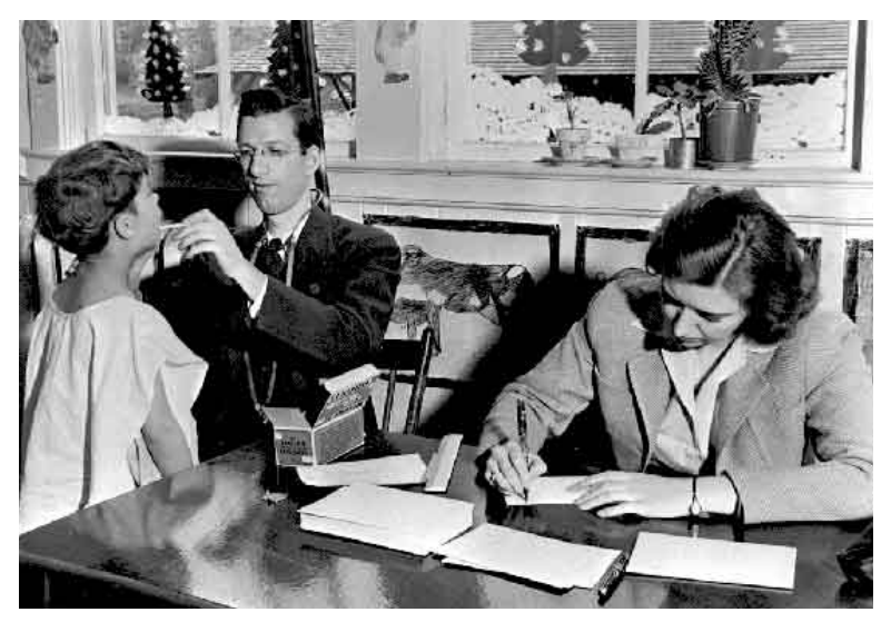
Medical checkup, Lumby School, North Okanagan, 1945.